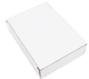
Product packaging Standard card box.